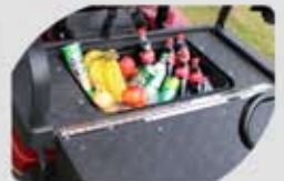
Two tone seats