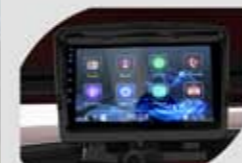
9" Bluetooth Touchscreen W/Back-up Camera