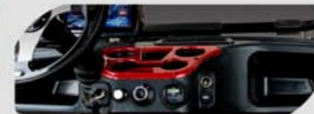
USB Socket + 12V Power Outlet Color matched dashboard