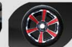
14" Color Matched Radial Tires